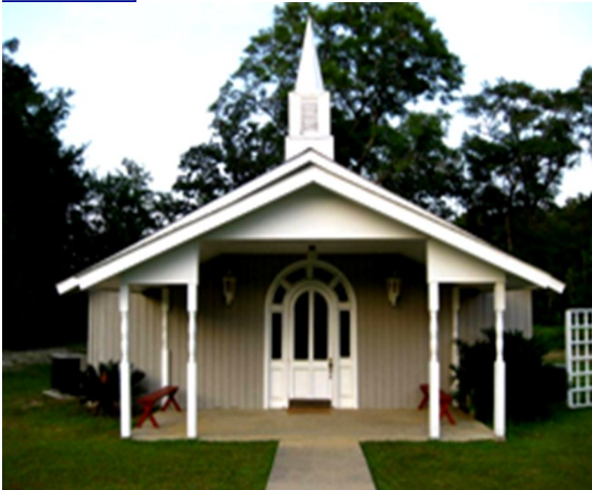
CHAPEL AT CAMP JACKSON